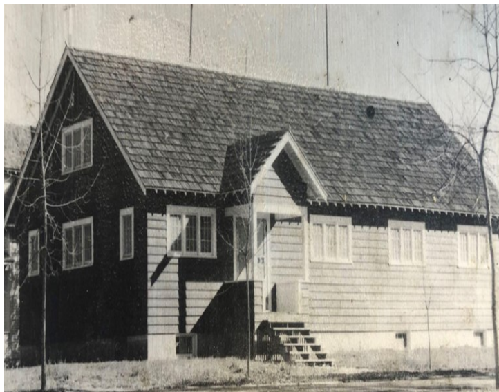
Current Photo: 2025