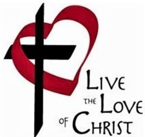
News for “The Happenings”