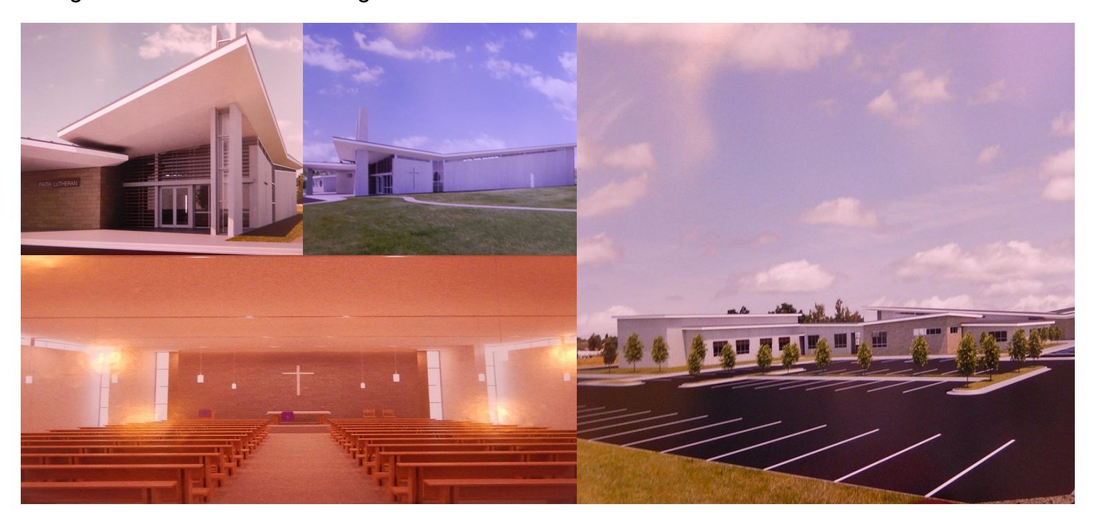
The Future — Faith Lutheran Church — Great Falls, Montana

We see great blessings and strength poured out upon us from our gracious God as we live out this grand adventure of following Jesus wherever He leads!